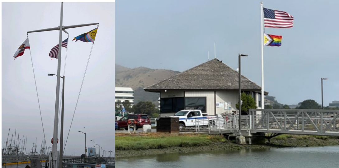
June is LGBTQIA+ Pride Month