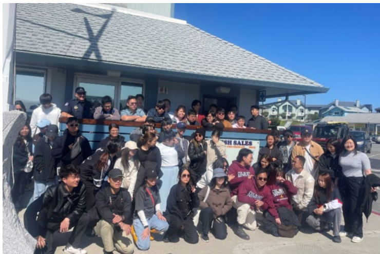
Students from Singapore were provided tour of PPH.