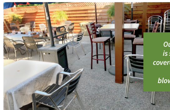
Outdoor seating area is swept frequently, is covered, and has fencing to keep debris from blowing into the street.