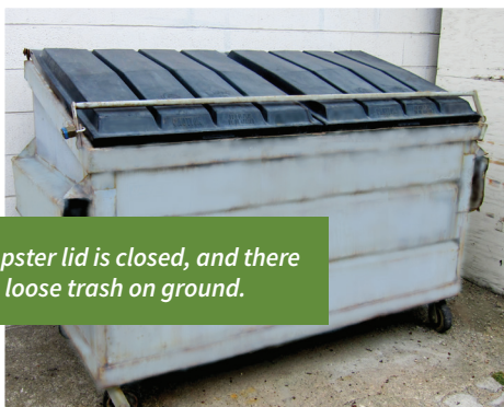
Dumpster lid is closed, and there is no loose trash on ground.