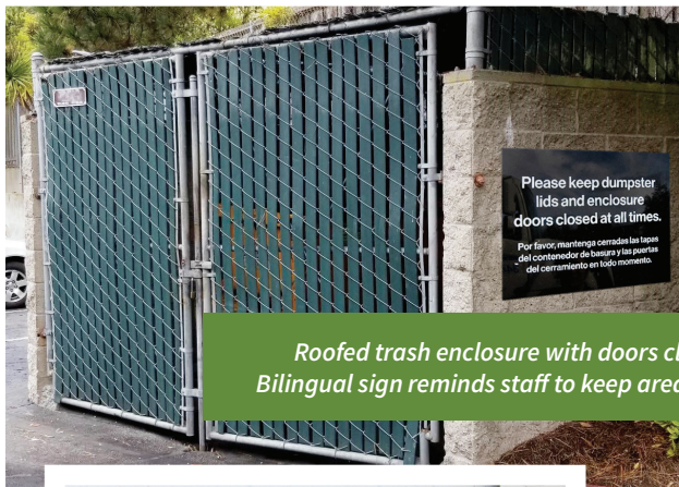
Roofed trash enclosure with doors closed. Bilingual sign reminds staff to keep area tidy.

It is the responsibility of your business to use appropriate Best Management Practices (BMPs) to keep wind or rain from carrying pollution into the street.