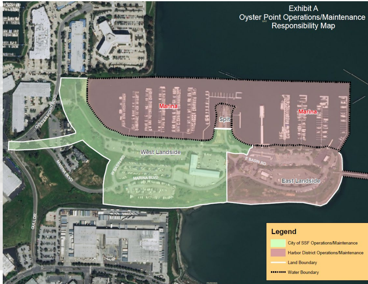
Exhibit A Oyster Point Operations/Maintenance Responsibility Map