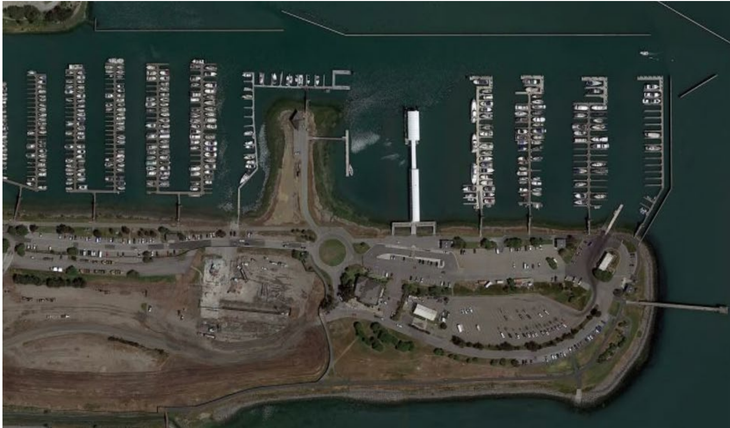
Exhibit D: Operational Performance Indicators (OPIs)